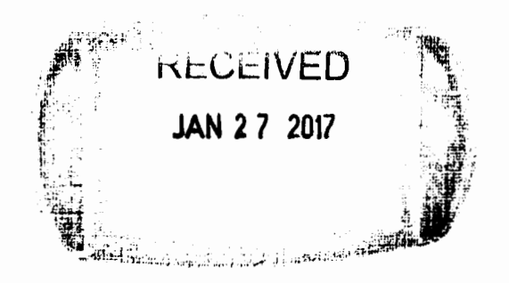
3 WATKINS, WARD AND STAFFORD, PLLC CERTIFIED PUBLIC ACCOUNTANTS